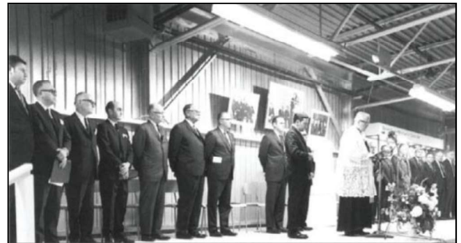
Powder Plant Inauguration Ceremony, October 1968

It can be seen that the metal powders was an ambitious project right from the start!