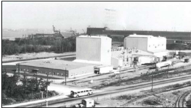
Aerial view of the Powder Plant in Sorel-Tracy, Quebec Canada in 1969